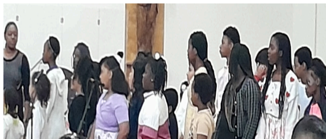
School choir singing at St. Benedict the Moor Church