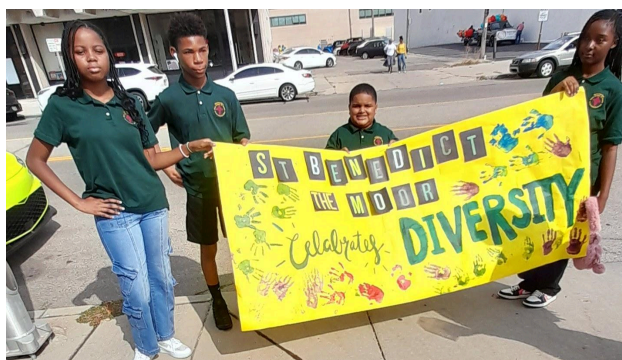
Students participated in the Hispanic Heritage Festival