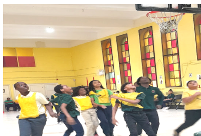
The Boys All-Star Basketball Game