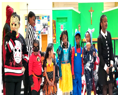
The Halloween costume contest